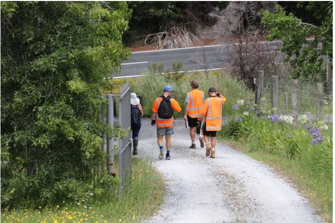
Team WSP Opus - Walking the walk

The findings will be presented as part of a comprehensive business case to Government Ministers and MP's mid-May to seek funding for the project.