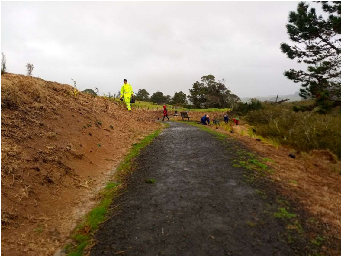
Planting at Te Whau, Snells Beach - rain or shine!