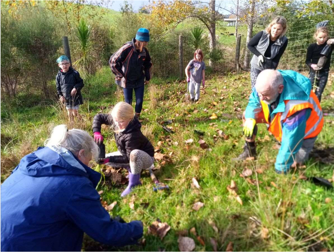
Trees for Survival planting day

The Mahurangi Trail Society is having a busy planting season with four planting days down and one to go. Already completed are three successful plantings on Snells Beach trails and one at Duck Creek trail on Solway Deer Farm.