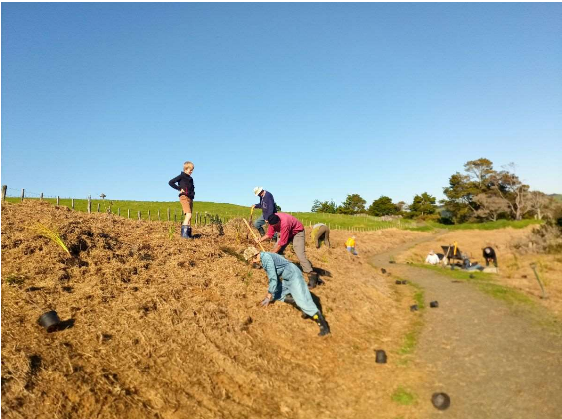
Planting at Te Whau, Snells Beach - in the sun