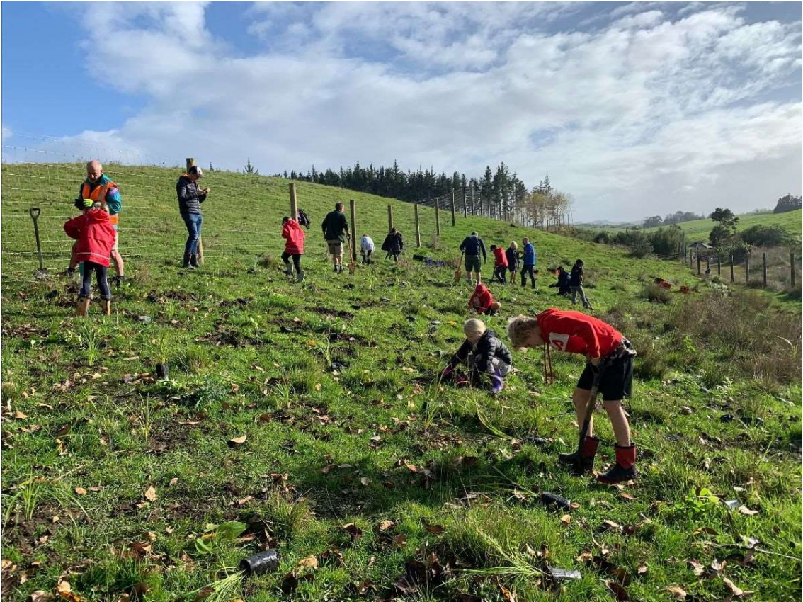
Trees for Survival planting adjacent to the future trail on Solway Deer Farm. Special thanks to Snells Beach School and Warkworth Rotary.