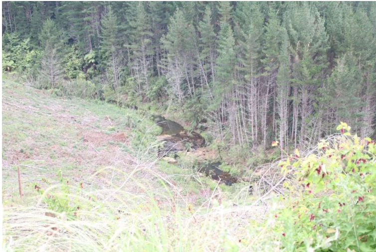
The Mahurangi River Crossing, another major area of focus for MCTT

The team surveying the route down to the Mahurangi River crossing at the north end of the API land